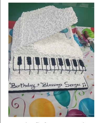
A cake fit for an Organist!