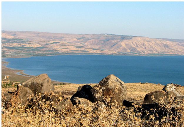
The Sea of Galilee

Not a new idea, but being there makes it more vivid. Jesus must have had a very strong and authoritative voice.