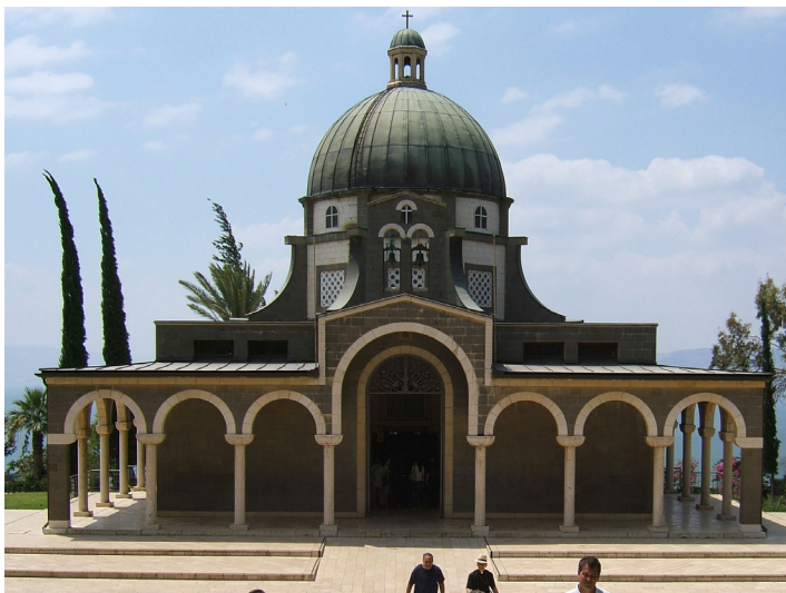
The Church of the Beatitudes

Standing where the Sermon on the Mount was delivered, within sight of the Sea of Galilee, where Jesus spoke to “crowds”, the impression is very strong. We don’t know the size of the “crowds”: 20? 200? 2000?