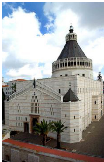
The Basilica of the Annunciation

Marking the spot today is a church, a monastery (with guest house) and a quiet garden (or as quiet as the hordes of tourists permit).